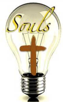
Think Souls First