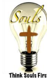
Think Souls First