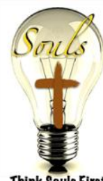
Think Souls First