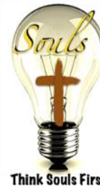
Think Souls First