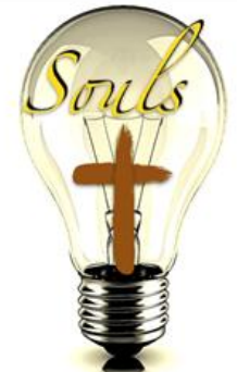
Think Souls First