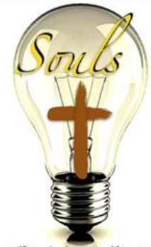
Think Souls First