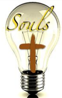
Think Souls First